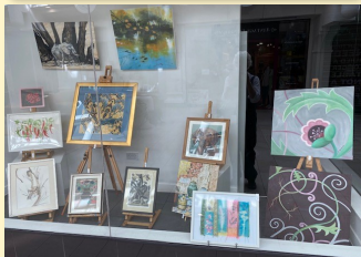
Works on display at the Artytime Exhibition

These were exhibited for sale at the Crowborough Community Centre and Royal Victoria Place in Tunbridge Wells and raised £770 for the charity. This will enable the present small building housing the Scrapstore and Artytime to extend into new premises that can be used as a youth and Arts Centre for the local community.