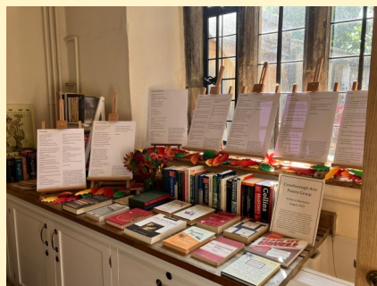
The poems, displayed on easels

You may remember that in the last newsletter, we reported on a visit to Bateman's, by our poetry group, 'Writing from Home'. Taking our visit as an inspiration, all seven members produced poems, which were then displayed in the kitchen of Rudyard Kipling's country home.